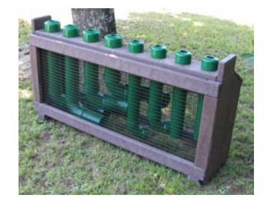
Diatonic Palm Pipe Drum