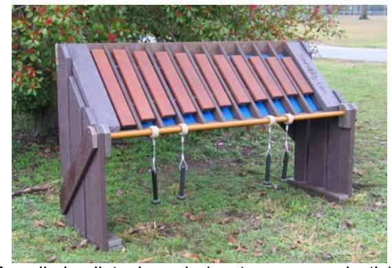
Amadinda, diatonic scale (post consumer plastic),

AMADINDAS Ipe' (Brazilian hardwood) tone bars without resonators