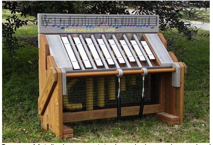
Soprano Metallophone, pentatonic scale, lowered pre-school height, (southern yellow pine) Music panel

Accessible musical instruments for people of all ages to enjoy self-expression and build community through music.