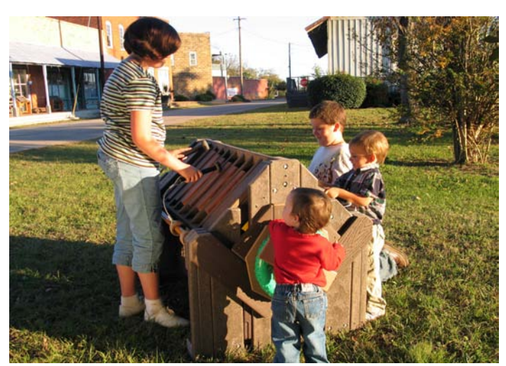
Preschool Music Station.

MUSIC STATION: Marimba, Rain Wheel, Metallophone, and Tongue Drum pair.