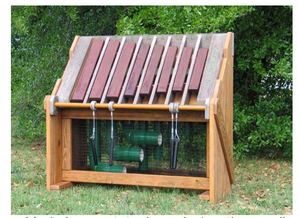
Tenor Marimba, pentatonic scale (southern yellow pine)

MARIMBAS Ipe' (Brazilian hardwood) tone bars with PVC resonators.