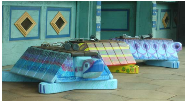
Box Turtle Drums, painted & sealed No two are alike

Sea Turtle Drum (not shown) stained & sealed painted and sealed